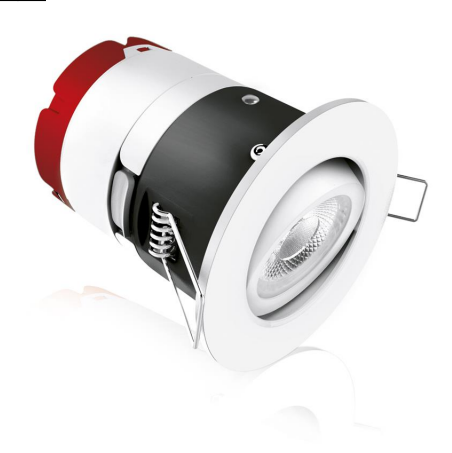
mPro<sup>™</sup> Adjustable IP65 Dimmable Fire Rated Downlight