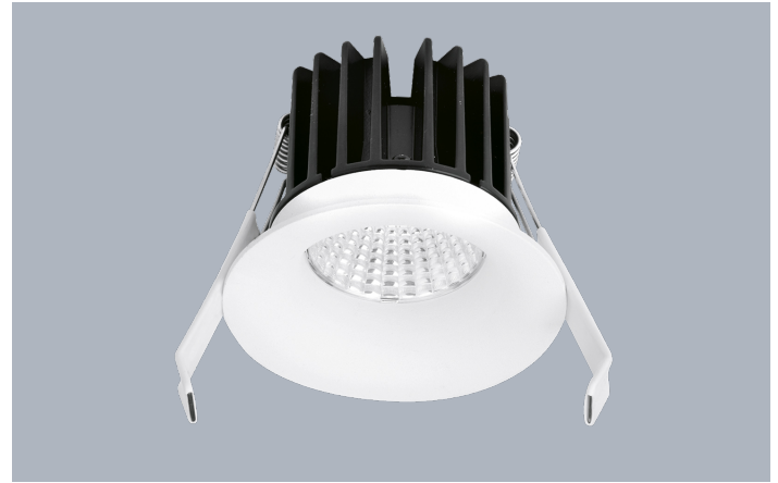
CurveE™ 7W Baffled Dimmable IP44 LED Downlight