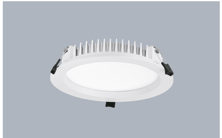
Lumi-Fit™ 40W High Performance Dimmable LED Downlight